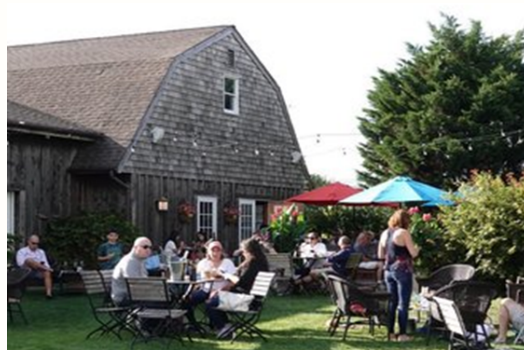
THE TASTING ROOM, RIVERHEAD

AT ROANOKE VINEYARDS, COTTAGE OR THE WINE BAR