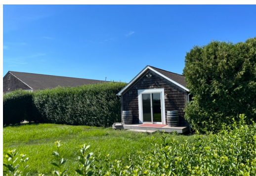
TASTING COTTAGE, RIVERHEAD