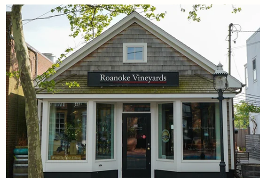
THE WINE BAR, MATTITUCK

Perfectly paired, Roanoke Vineyards with K2 Catering, we are here to help you celebrate life's special moments at one of our three locations that best fits your needs. We offer a variety of event options. As always, discuss with us specialty needs and we are happy to work with you to develop a custom event or menu that exceeds your expectations.